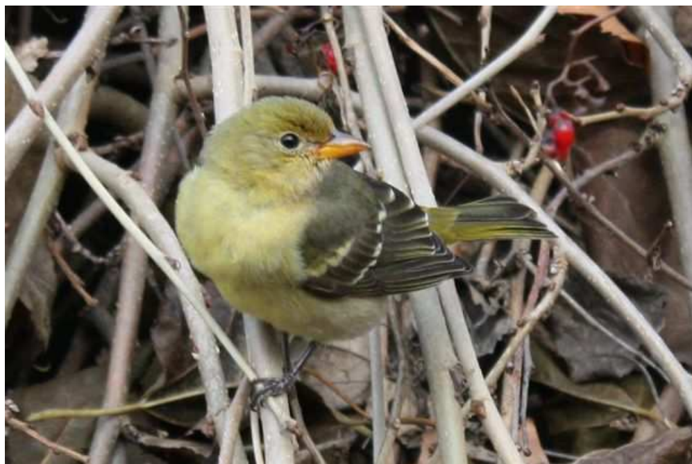
This western tanager puzzled us during the Lake Sacajawea bird walk. The bird is rather late heading south for the winter.