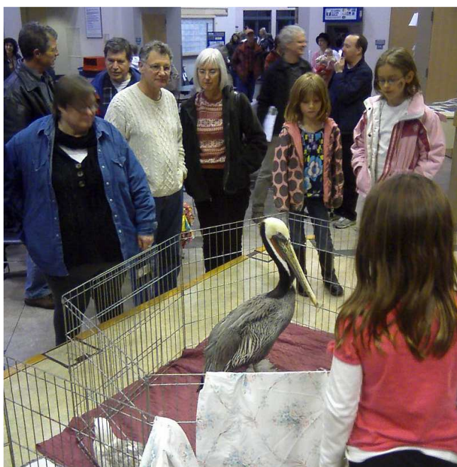
Impressions from the Bird Rehabilitation presentation which included this live pelican.