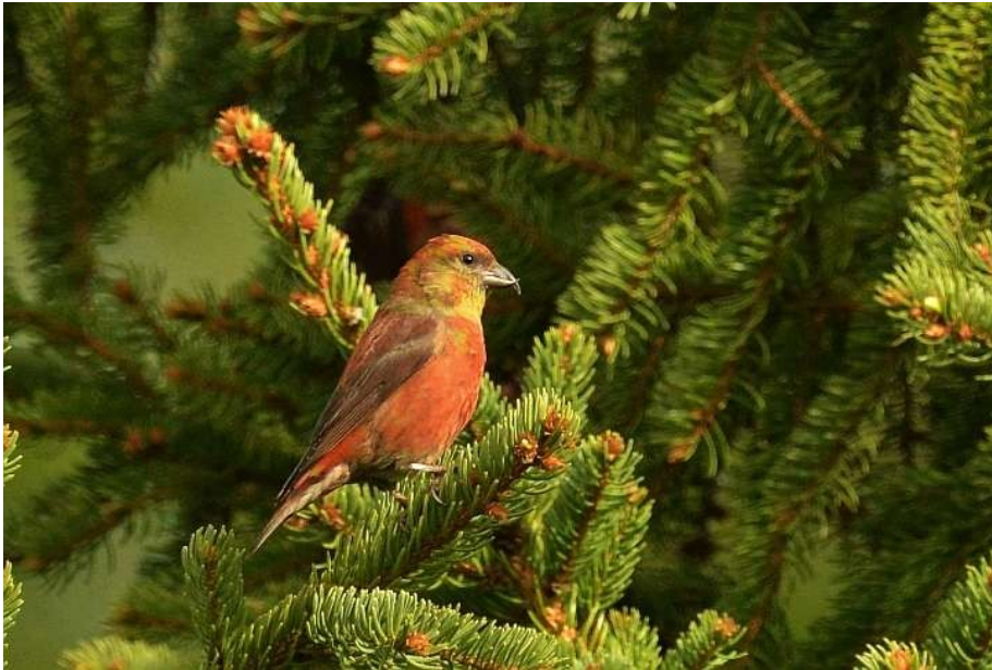
Red Crossbill

Royce Craig captured this photo of a Red Crossbill in late May on his property.