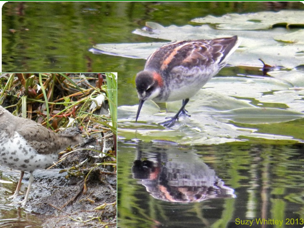
Suzy Whitney 2013