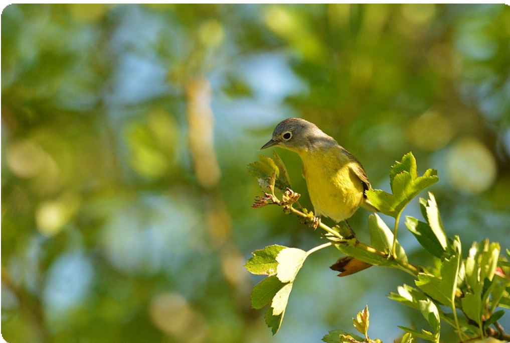
Nashville Warbler

In the years before strict environmental regulation, workers at the Reynolds Aluminum plant dumped waste that seeped into the soil and will eventually contaminate ground water and the Columbia River. The most prevalent contaminants are arsenic and fluoride. Now, Alcoa, which still owns the site, and Millennium Bulk Terminals, which rents the use of the facilities, are responsible for cleaning it up. In a presentation at Lower Columbia College on June 13, James DeMay from Department of Natural Resources said that public meetings on the proposal to clean up this site would be in "early 2014".