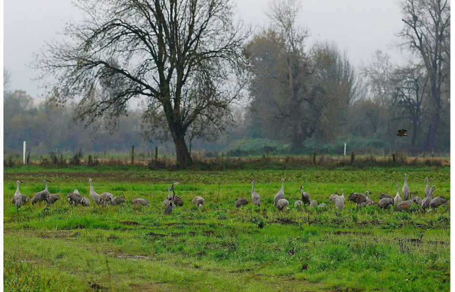
Sandhill Cranes and Blue Heron at Woodland bottoms